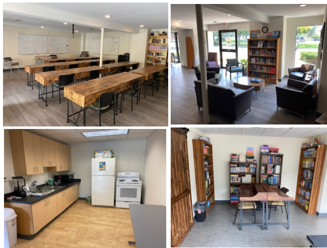
From top left, clockwise: the main classroom, an adjacent lounge area, the library, and the kitchen.

Thumbnail views of the new Horizon High School