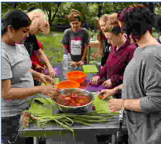
Horizon students cleaning vegetables they'd harvested at the Community Groundworks Garden