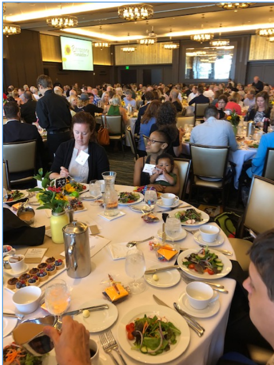
Horizon Students and Staff at Annual Recovery Lunch in September 2018