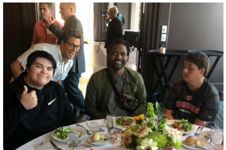
Horizon Students and Staff at Annual Recovery Lunch in September 2019

--Students experienced an increasing number of difficulties over time, including substance use and mental health disorders, food insecurity, residential instability, and homelessness.