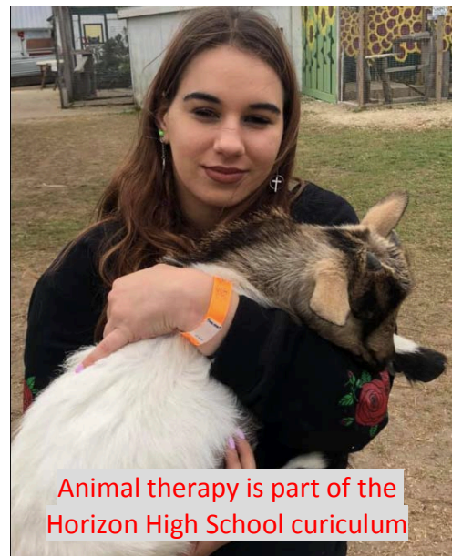
Animal therapy is part of the Horizon High School curriculum