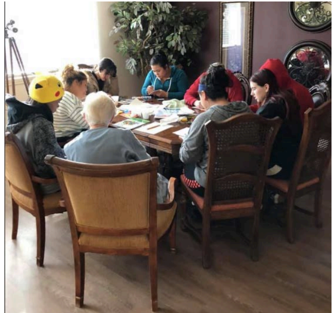
Horizon High School students weekly visit senior citizens at the Jefferson Senior Home