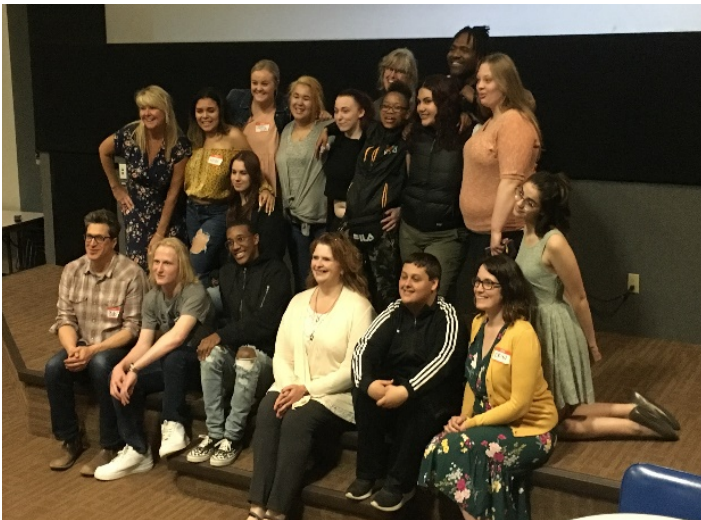
Horizon High School students and staff at the May 14, 2019 HHS fundraiser at Rocky Rococo

The students also have many opportunities to spend time in the community and give back. Mondays the students have been volunteering at The Jefferson. Spending time with our older generation. On Tuesday's our students have gone to farms, volunteered for the Berbee Derby, MATC tour, gone hiking, Union South and Memorial Union. Wednesdays the students participate in Art therapy. Thursdays the students go to The Princeton Club and work out. Fridays has turned into classic movie afternoon with students being exposed to movies from the AFI's top 100 list.