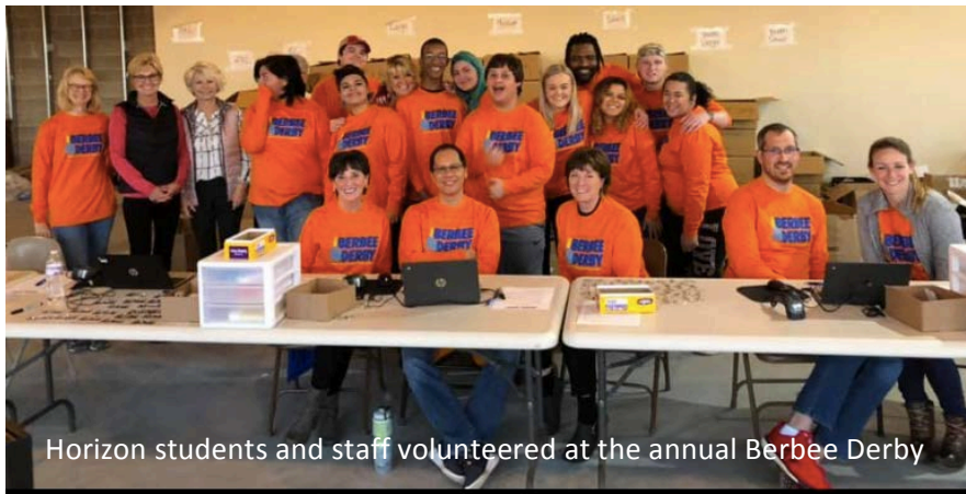
Horizon students and staff volunteered at the annual Berbee Derby